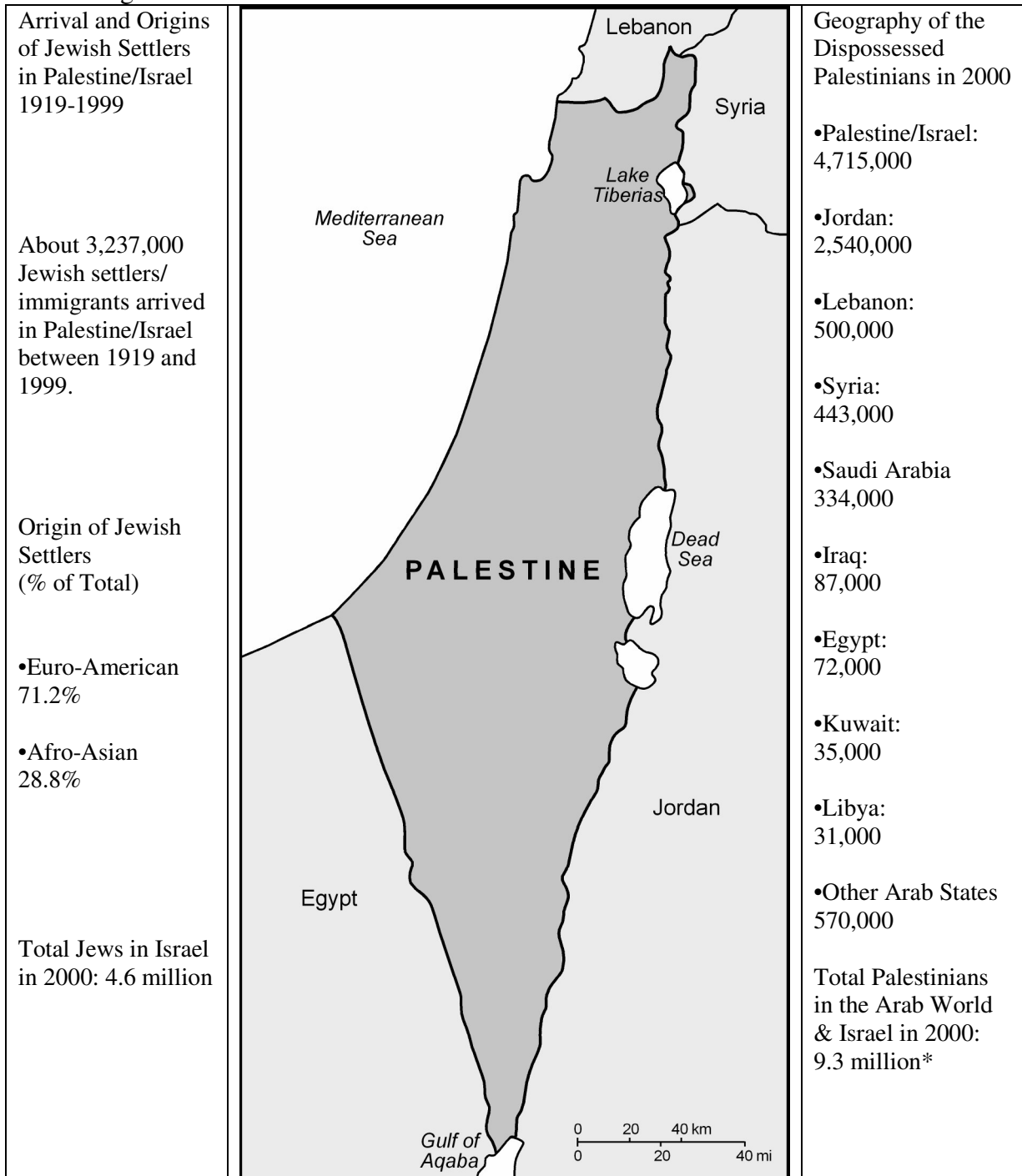
Figure 3. Arthur Balfour's Promised Homeland for the Jews